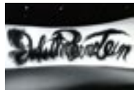
p.24 Judith Bernstein, SIGNATURE PIECE , 1986, charcoal, 14 x 45 feet. Installation view: Hillwood Art Museum, Greenvale, NY.