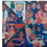
p. 30 Faith Ringgold, For the Women's House , 1971, oil on canvas, 96 x 96 inches. © 1971 Faith Ringgold. Courtesy of the artist.