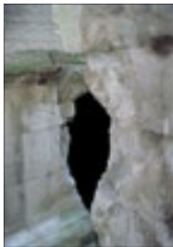
p. 07 JoAnn Verberg, L'Arco di Druso , 2011, ink on paper. Courtesy of the artist.