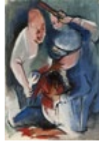
p. 28 Norman Lewis, Untitled (Police Beating) , 1943, watercolor, ink, and graphite on paper, 20 x 13 7/8 inches.