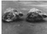
p. 04 Giuseppe Penone, Essere fiume , 1981, two stones, 50 x 33 x 30 cm.