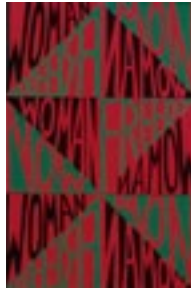
p. 27 Faith Ringgold, Woman Freedom Now , 1971, cut paper, 30 x 20 inches, © 1971 Faith Ringgold. Courtesy of the artist.