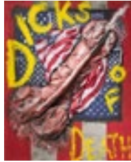
p. 25 Judith Bernstein, Dicks of Death , 2015, mixed media, 10 x 8 feet.